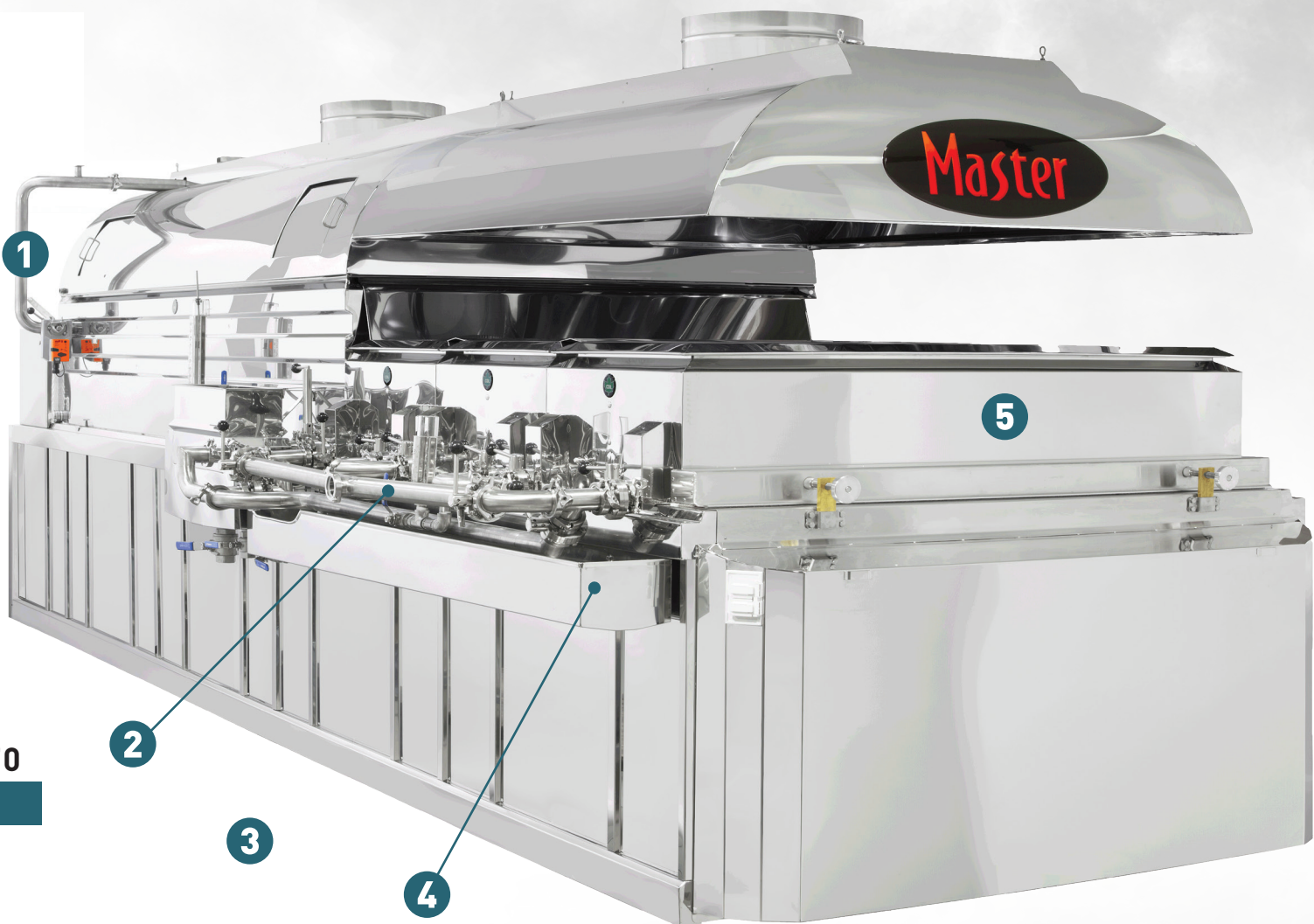
Wood model shown

The CDL Master Evaporator is the only evaporator on the market evaporating over 5.1 Imp. gal. / ft 2 or 6 U.S. gal. / ft 2 of pan.