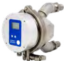
Continuous Brix reader