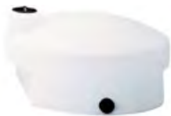
For pickup truck